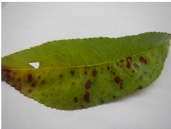
One of the many plant disease samples brought into the Extension office for identification.

4-H is the largest youth development organization in Michigan. In addition to offering the typical club-format, Missaukee 4-H offered a series of free community classes for fair exhibitors. Hands-on sessions helped increase knowledge, showmanship skills and profitability of market projects while focusing on entrepreneurial skills and practices to keep youth and animals safe and healthy. In 2018 Missaukee County had 15 4-H clubs with 25 adult volunteers. The total number of youth served in Missaukee county was 645. Four new clubs were formed, featuring sewing, arts & crafts, leadership/community service and shooting sports project areas.