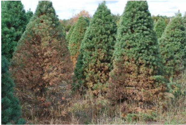
Early needle loss caused by brown spot needle blight shows up on infected Scotch pine in the fall before harvest making Christmas trees unsalable.