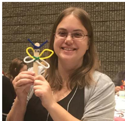
Many trainings are held to spread new ideas and knowledge including the Power of Puppets.

Parents and caregivers are the very first to have influence on a child's development. Early childhood education equips parents and caregivers with the tools and knowledge necessary to become their child's best advocate. Educational workshops are available in a variety of formats and include hands-on activities. Training hours are available for licensed childcare providers and topics include positive discipline, play, school readiness, literacy, and resilience.