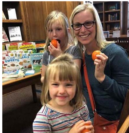
Taste testing fruits and vegetables during a "My Plate" presentation at the library was an enjoyable experience.

MSU Extension's Supplemental Nutrition Assistance Program provides basic nutrition education and hands-on activities for all ages. "Jump Into Foods and Fitness" includes physical activity and nutrition for elementary children. Teens participated in "Teen Cuisine", a hands-on cooking class that teaches basic skills, safety and confidence for managing their own kitchens. It is estimated that every $1 spent on nutrition education saves as much as $10 in long-term health costs.