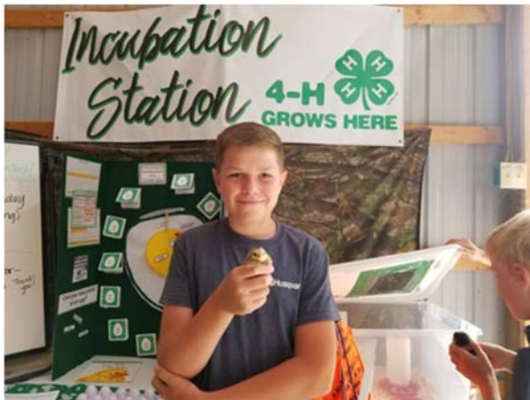
A series of community classes offered at the Falmouth Youth Show to increase knowledge and showmanship skills included the “4-H Incubation Station.”

“What’s wrong with my tree?” is the most common question MSU Extension receives from Christmas tree growers. With the value of Christmas trees being determined by tree appearance, anything that affects foliage quality and tree form can reduce the salability of the tree. MSU Extension is able to help diagnose tree problems and provides the most current information on soil nutrition, pest management and other production concerns through on farm consultations, educational programs and research.