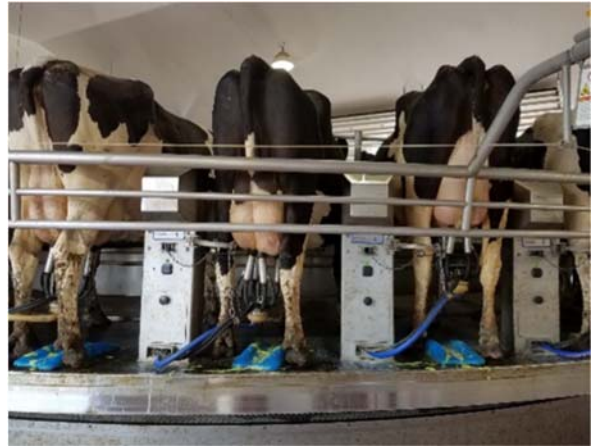
Following a consistent milking routine enhances efficient parlor management and milk quality.

The MSU Extension dairy team provides educational programs that enhance dairy farm management. One program held in 2018 focused on making more money from the milking parlor. Participants learned about the importance of training employees to follow a consistent milking routine, low-stress handling of cows and overall efficiency in the milking parlor. Based on knowledge gained at the meeting, farm managers and employees planned to make changes that would improve milk quality, cow health and profitability.